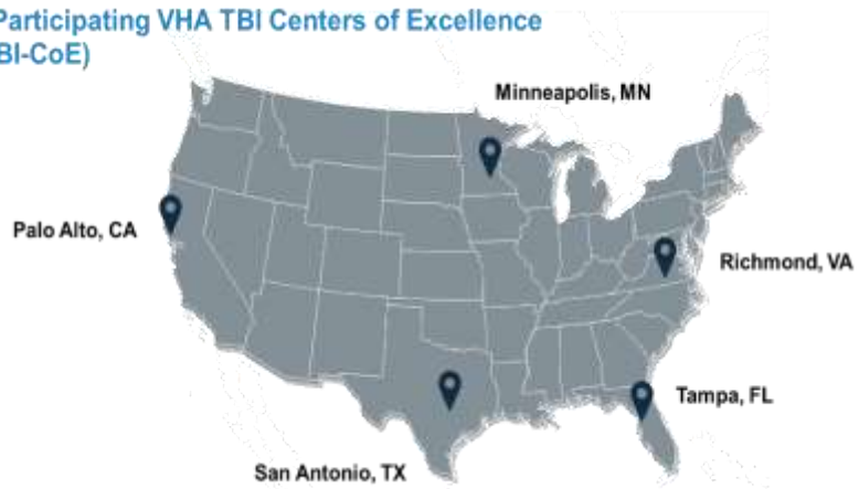
5 Participating VHA TBI Centers of Excellence (TBI-CoE)

The goal of the PM&R National Program Office is to facilitate the implementation of the high consumer demand IETP to all VHA TBI Centers of Excellence (TBI-CoE). The TBI-IETP program is fully implemented at the Tampa VA but has had limited implementation throughout VA. This partnered evaluation initiative will use mixed-methods to support system-wide implementation and evaluation of the TBI-IETP to all five TBI-CoE.